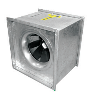
Mixed Flow In-Line Fan