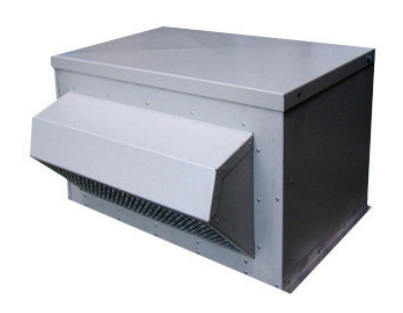
Roof Top Twin Fan