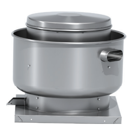
Centrifugal Roof Mounted Fan - CUBE