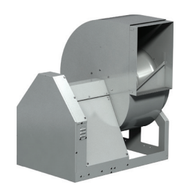
Centrifugal Utility Fan - USF